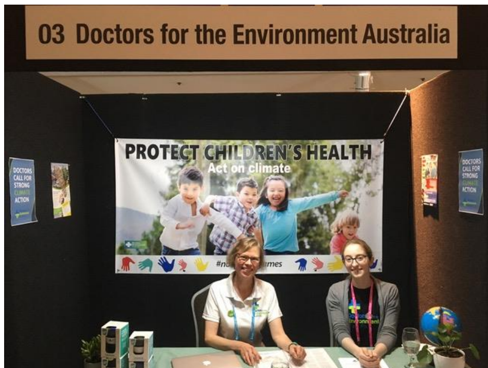
DEA stall at AMA National Conference