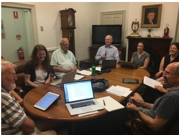
Air-conditioned DEA SA Committee meeting on 23 January 2019 – the day before the records fell!

Adelaide had the dubious honour of being the hottest city on the planet on Thursday 24 January, reaching a temperature of 46.6°C, surpassing Melbourne (46.4°C in 2009) as the hottest Australian city ever! But spare a thought for our colleagues in Port Augusta where the temperature reached 49.1°C.