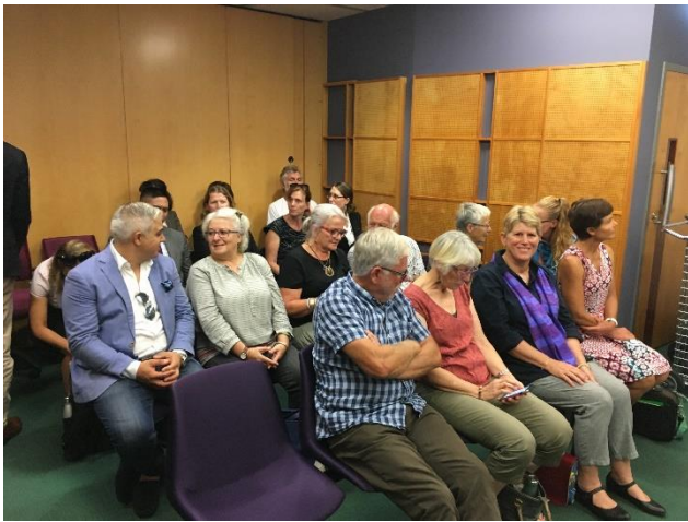
NSW Land and Environment Court Rocky Hill coal mine hearing

Firstly, some good news. In February, the Rocky Hill coal mine proposal was disallowed by a court decision. In a landmark judgement, the NSW Land and Environment Court considered climate change in part of its ruling. This is an Australian first, and a highly significant ruling. Its importance is not only that the mine would contribute to climate change, but that the issue is relevant under the applicable law.