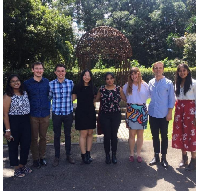
NSC in Adelaide at 2018 AGM

This year we set our sights on three main campaigns run at campuses across Australia.