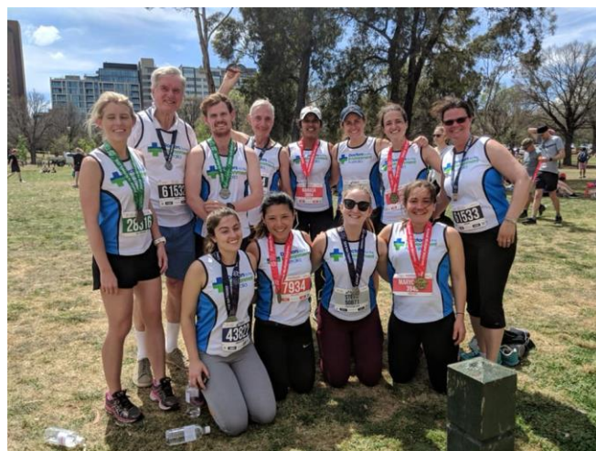
VIC members complete another Melbourne Marathon (2018)