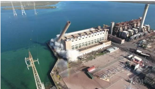
Screenshot of the demolition of Playford A Power Station chimney on 9 September 2016 in Port Augusta

DEA worked for five years to inform the citizens of Port Augusta about the health effects of their power stations (such as increases in cancer of the lung and childhood asthma) and to support community aspiration for the development of renewable energy sources to replace employment in the power stations. 16 The remaining power station was closed in 2016, five years after DEA and Beyond Zero Emissions (BZE) gave our initial community presentation on health effects and on the potential for replacement solar thermal technology.