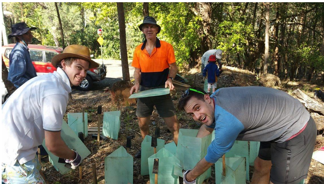
DEA members in Brisbane participate in National Tree Day

We also attended a Health and Outdoor Learning Workshop on 23 rd May 2017 about learning in nature. A lead researcher from the UK spoke to senior members of the Health and Education Departments on the 'Natural Connections' program which ran over 4 years in England. Over 100 schools made the move to teach in green spaces, which facilitates learning and supports child development and behaviour.