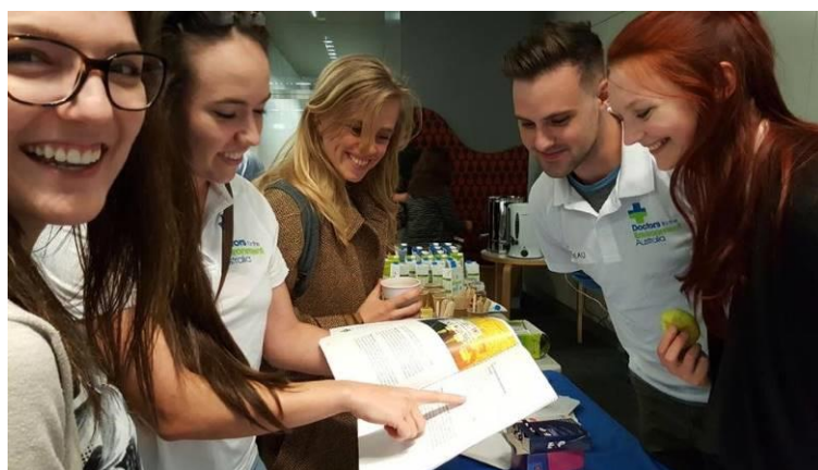
DEA students at iDEA17