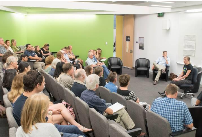
WA Health, Energy and Climate Change Symposium

This year's educational highlight was the annual iDEA17 meeting held in Melbourne in April. It was a great success and a source of information and inspiration for all. For more information, see the iDEA17 section below. Many other meetings have been held in all states.