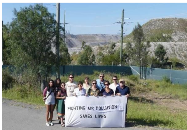
DEA NSW members meet with concerned residents living near the Bulga coal mine in the Upper Hunter

In a submission to the NSW government, DEA outlined its concerns regarding the health impacts of the open cut Rocky Hill coal mine within one kilometre of residences in Gloucester, along with other nearby villages Warkworth, Jerrys Plain, Bulga and Singleton, which already suffered from poor air quality. DEA identified the health risks from air pollution and from blasting for these communities. 24