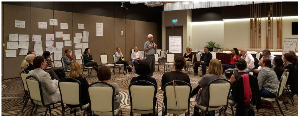
SCHN staff at the open space forum, 18th October, Sydney